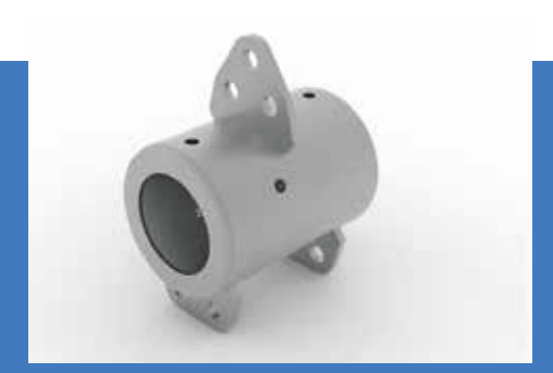
Between the Flange