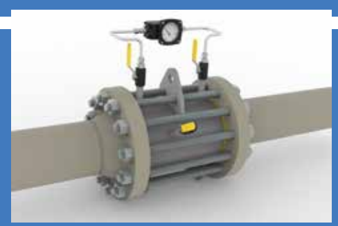
Between the Flange (Installed)